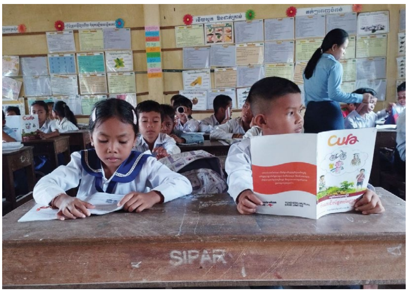
▲ Students taking part in the Children's Financial Literary (CFL) program in Cambodia.